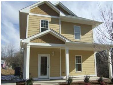
807 Carroll Street: 3 Bedrooms, 2.5 Baths

Cameron Place homes are passive solar designed and include elements such as south-facing windows that utilize the sun's heating and cooling abilities.