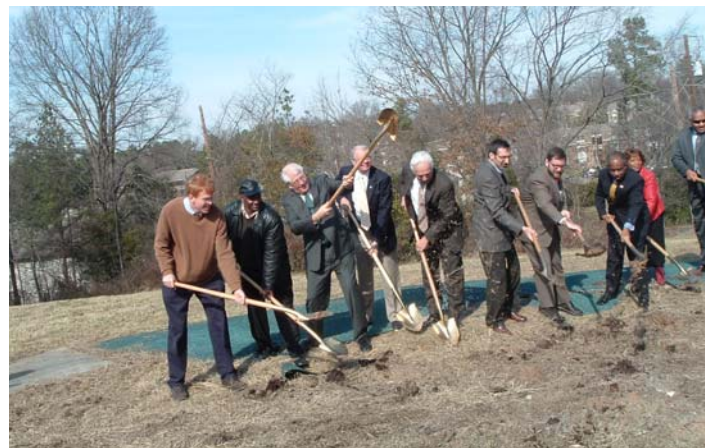
Congressman David Price, Mayor Bell & the Maplewood Square partners break ground on the 32 unit senior housing complex.

Maplewood Square will feature 32 one and two-bedroom apartment units for low-income seniors age 55 and older. Both Duke